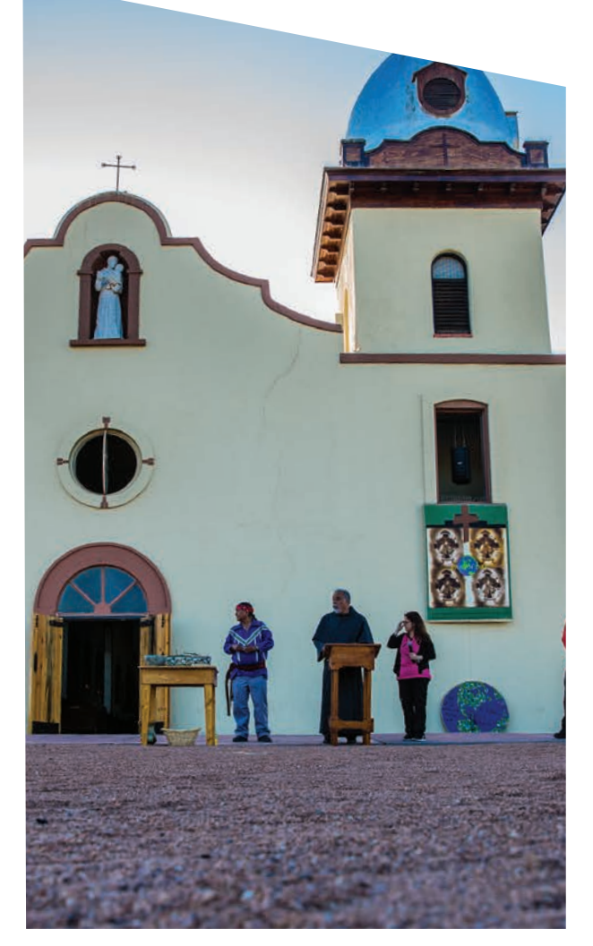
The Corpus Christi de San Antonio de la Ysleta del Sur MIssion, established in 1680.

11. Pope Francis expressed the Church's entire teaching on migration in that moment on the Rio Grande: encounter, conversion and compassion. This teaching rests on ancient foundations. The Old Testament is clear: "You shall treat the alien who resides with you no differently than the natives born among you; you shall love the alien as yourself; for you too were once aliens in the land of Egypt" ( Lev. 19:34). Jesus himself was a refugee on the flight into Egypt (cf. Mt. 2:13-23). We know that God stands on the side of migrants, and "is not ashamed to be called their God,