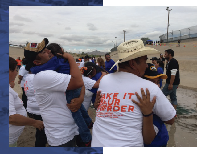
The Hugs Not Walls Event unites families from El Paso and Ciudad Juarez.

5. Providence has blessed the peoples, lands and mountains of the Chihuahuan Desert, a place of constant migration. Our desert has been home to indigenous