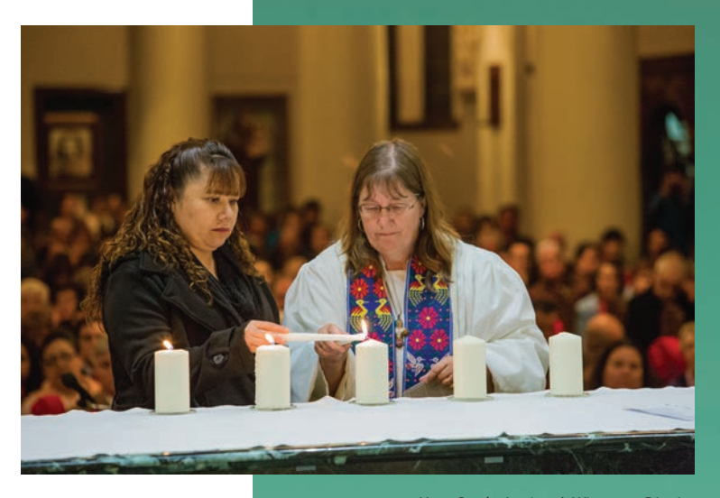
Hope Border Institute's Witness to Dianity

In times of anguish and confusion we ask- where is God? But the Gospel teaches us that we will find Him among the poor and excluded, in their "struggle for survival" which "contains within it a profound understanding of life which often includes a deep religious sense."<sup>8</sup> As our Holy Father says, the poor "have much to teach us. We need to let ourselves be evangelized by them." 9