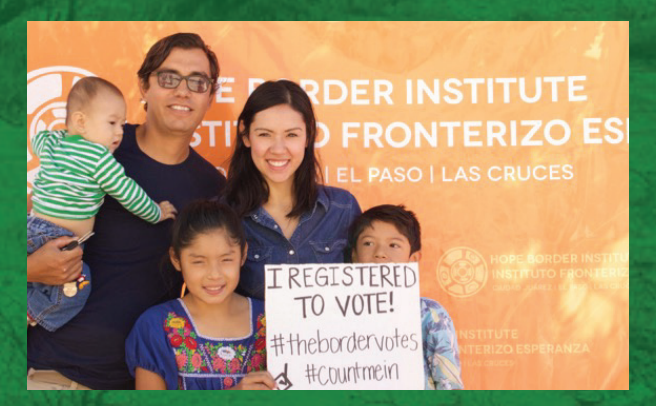
The Hope Border Institute registers new Americans to vote.

In all these works, we see how Christ continues to unite himself to humanity in our time. As your bishop, I have much for which to be grateful.